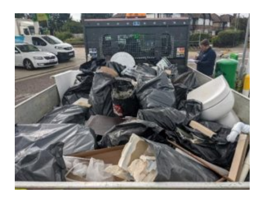
Op Assist at Medway with Medway Council Environmental Enforcement Team. Numerous vehicles stopped and two vehicles seized for no tax